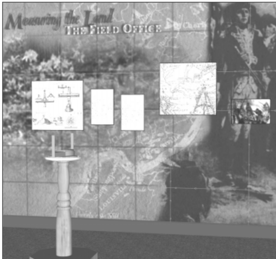
Concept sketch for a segment of the new Locust Grove permanent exhibit by Solid Light, Inc.

From the start, we wanted to tell the stories that are difficult to communicate through the historic house itself, including the military career of General Clark, which