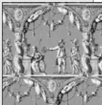
Detail of paper in Gen. Clark's room.

Locust Grove will be open all day — free to the public. We'll have several accompanying events, demonstrations, re-enactments, and general festivity. Join us here!