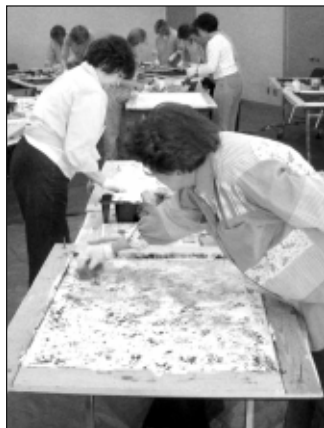
Creativity reigns supreme in one of Virginia's floor cloth workshops.

The fee includes frames, canvas, paint, brushes, and other materials. The workshop is held in two sessions to allow the first day's paint to dry. Cost: $90 for the two-day workshop. Please bring a bag lunch on Saturday.