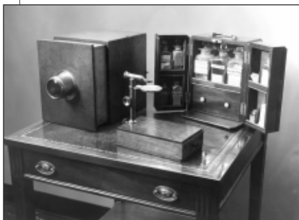
These are some of the scientific and medical instruments and other items that are a part of Transylvania University's priceless collection.