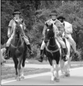
Reenactors portraying Meriwether Lewis and William Clark ride to Locust Grove in 2006 to commemorate the explorers' dinner at Locust Grove on November 8, 1806. It was part of Louisville's Lewis & Clark Bicentennial Celebration.

Wednesday, November 3, 5:00 p.m.–7:00 p.m.