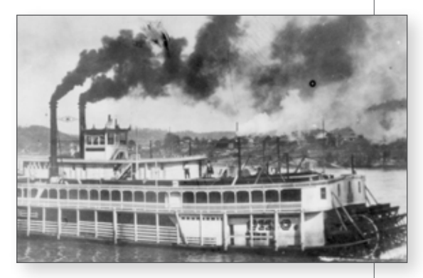
The arrival of steamboats in Louisville in 1811 changed life on the Ohio River forever.

In Europe, the Napoleonic Wars pitted Britain against France, with America officially neutral. But British harassment of American shipping renewed