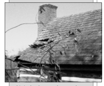
This is the damage that's under that bright blue tarp on the Wood Shop cabin roof.

In early November, workers were carefully removing an old cherry tree at the northwest corner of the building. The tree was in such bad shape that we were afraid it would fall onto the cabin and damage it.