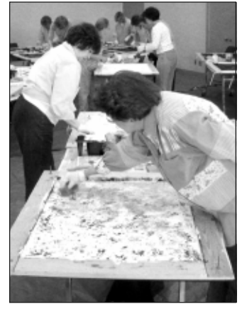
Creativity reigns supreme in one of Virginia's floor cloth workshops.

The fee includes frames, canvas, paint, brushes, and other materials. The workshop is held in two sessions to allow the first day's paint to dry. Cost: $90 for the two-day workshop. Please bring a bag lunch on Saturday.