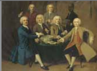
Artwork: British School, 18th Century