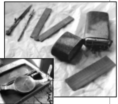
Early surveyor's compass and tool kit.