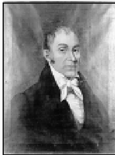
Ephraim McDowell image from the Clendenen Library Portrait Collection.

On Christmas Day 1809, a thousand miles away from the nearest hospital and 35 years before the discovery of anesthesia, Dr. McDowell removed a 22-pound ovarian tumor from the abdomen of a 46-year-old woman, Jane Todd Crawford. It was the world's first ovariectomy, and it eventually brought McDowell worldwide acclaim as the "Father of Abdominal Surgery." Free admission.