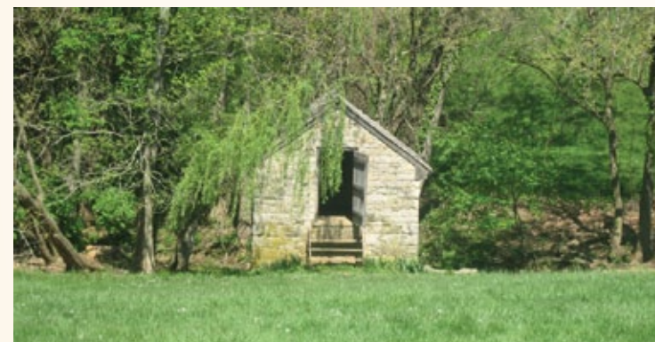
Youth Category — Julia Goodin