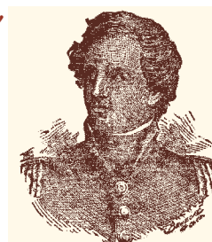
Col. GEORGE CROGHAN The Hero of FORT STEPHENSON. August 2, 1813