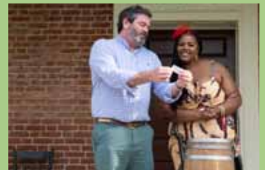
Above: A crowd of donors, board members, and Friends of Locust Grove celebrate during the soft opening of the Pavilion on April 30