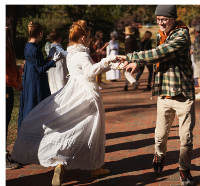
Visitors learned to dance the Sir Roger de Coverley dance with First Person Interpreters at the close of the event.