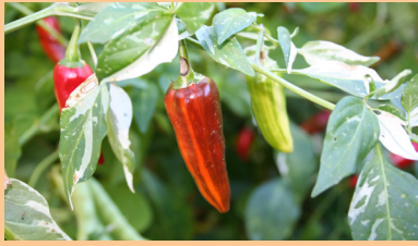
Fish peppers, named because they often were used to make a hot seasoned vinegar to sprinkle on fried fish — which Louisa could have caught from the Ohio River.