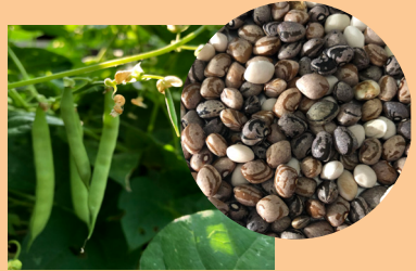
Greasy Beans — On the vine and shelled Greasy beans can be eaten as a green bean; but the seeds can also be cooked up like any other dry bean over the winter. Dual purpose practicality!

As for the larger fauna, our gardener Sarah Sutherland warns, “Deer are beautiful, graceful, and gentle, and it seems kind to feed them, especially when they have fawns at their side. However, feeding deer draws them closer to human habitation and our roadways. Please leave deer to forage in the woods, away from our homes, landscaping, and roads. If you see a dead deer (or other animal) in the roadway, call 311 to file a report with Metro.