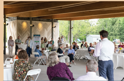
PAVILION GRAND OPENING