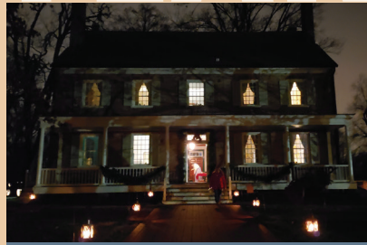
CHRISTMAS ON THE FARM

May 18 — Kentucky Shakespeare presenting Hamlet , 6:30 p.m.