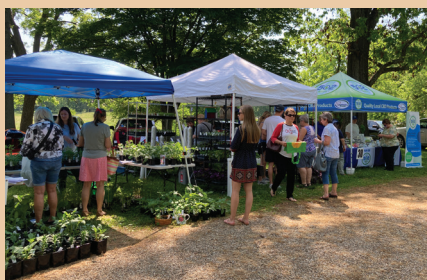
Gardeners' Fair/Spring on the Farm May 13-14, 10 AM – 4:30 PM

NON-PROFIT ORG US POSTAGE PAID MASONIC HOME, KY PERMIT NO. 16