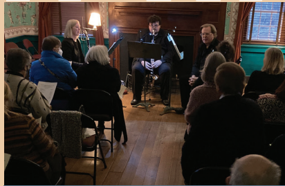
CHAMBER MUSIC CONCERTS