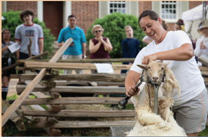
SPRING ON THE FARM