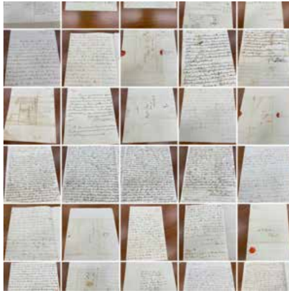
Snapshots of letters at the Library of Congress