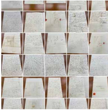
Snapshots of letters at the Library of Congress