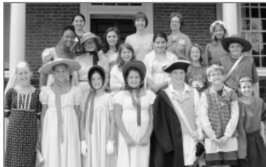
Junior Docent campers did their own costumed interpreting in front of relatives and friends on their last day at camp.

helping at our camps — leading walks in the woods ... being counselors ... giving tours of the house ... teaching costumed interpretation along with hearth cooking, candle dipping, spool knitting, wool dyeing ... helping with birdhouse construction, and much, much more! Thanks for your imagination and dedication to our educational programming.