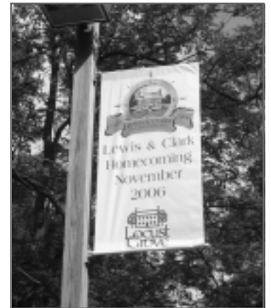
This is one of the banners on highways near Locust Grove that promote the Lewis & Clark Homecoming in November.

There's another public event on Sunday, November 12 — an