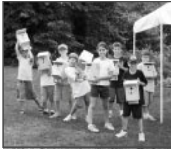
Woodworking Campers show off the birdhouses they made themselves.

Locust Grove woodworkers will lead campers in learning the basics of woodworking. Campers will learn about types of wood, historic and modern woodworking tools, and they will complete a project to take home. $75 per camper. Please call (502) 897-9845 to register.