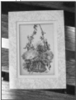
This is a copy of Thelma's watercolor that appears on a packet of Locust Grove Petunia Seeds.

Matted copies of some of Thelma's watercolors are available for purchase in Locust Grove's Museum Store.