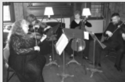
Mirabel String Quartet in February 2007