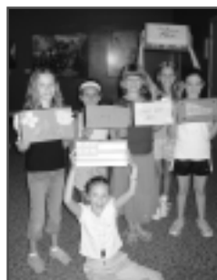
Campers are delighted with their Pioneer Camp Treasure Boxes.

This exciting camp provides a wonderful sampler of early pioneer life. Students participate in crafts such as weaving, writing with quills, and candle-making. They are part of activities such as storytelling, historic games, and nature walks. Cost: $80 per camper. Please call (502) 897-9845 to register.