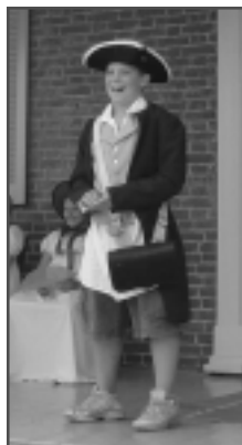
A Junior Docent Camper interprets General Clark.

Campers will look at how museums work and how they present history to the public and care for their collections of artifacts. This is a hands-on program where campers participate in activities such as creating a meal in our 19th century kitchen, trying their hand at early surveying techniques, bringing historic characters to life through costumes and first-person interpretation. $80 per camper. Please call (502) 897-9845 to register.