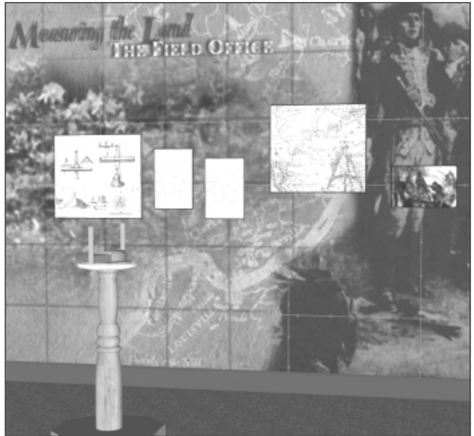
Concept sketch for a segment of the new Locust Grove permanent exhibit by Solid Light, Inc.

From the start, we wanted to tell the stories that are difficult to communicate through the historic house itself, including the military career of General Clark, which