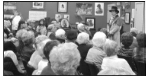
An overflow crowd is on hand for Bud Clark's Wednesday lecture in November 2006.