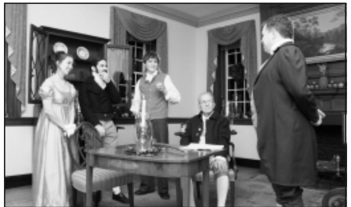
Costumed interpreters of all ages bring the 1820s to life during our holiday Candlelight tours in December.