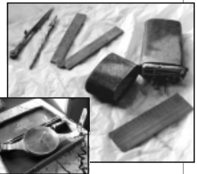
Early surveyor's compass and tool kit.