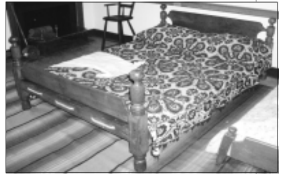
This rope bed with cannonball posts will be auctioned.

During our Fall Antiques Market, which will be held the Sunday before the auction, you'll have an opportunity to preview the collections items for sale. Additionally, the doors to the auction will open at 5:00 p.m. on the day of the sale so potential buyers can take a look at the possibilities.