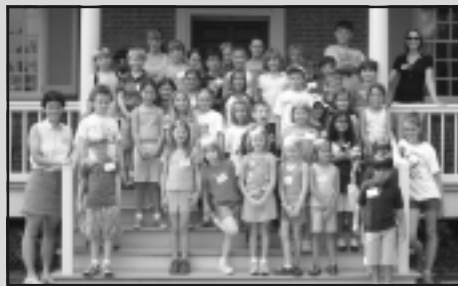
Happy Pioneer Campers on last day of camp in 2008.

It's new this year! Come learn history Indiana Jones-style! During this two-day camp, kids will participate in an actual archaeological dig on the grounds of Locust Grove. Help trained archaeologists discover what is hidden beneath the surface. Cost: $40 per camper.