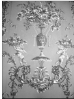
Locust Grove's ballroom wallpaper was just the beginning. Other rooms will be papered as well.

Bedroom) and, later, in the second floor northeast room. (By the way, many room names are going to change with our new understanding of the uses of these rooms.)