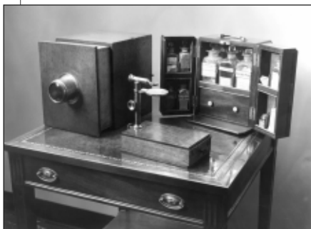
These are some of the scientific and medical instruments and other items that are a part of Transylvania University's priceless collection.