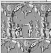
Detail of paper in Gen. Clark's room.

Locust Grove will be open all day — free to the public. We'll have several accompanying events, demonstrations, re-enactments, and general festivity. Join us here!