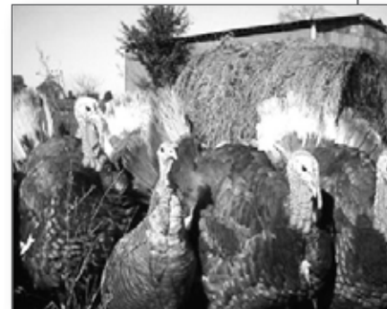
Some of Kathy Wheeler's Bourbon Red turkeys on her Star Farm in Hardyville, Ky.

The menu will include oyster stew, Buckeye chicken pate, country ham fritter, slow-roasted Kentucky Bourbon Red turkey, cornbread stuffing, "Three Sister Saute" (corn, beans, pumpkin), and cushaw pie. Cost: $25 per person for Friends of Locust Grove and Slow Food members; $30 for all others. Class size is limited. For reservations, please call (502) 897-9845.