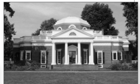
Thomas Jefferson's Monticello

Concessions will be available and tours of the house are included. Admission: $6 for adults, $3 for children 6-12, and free for children 5 and under.