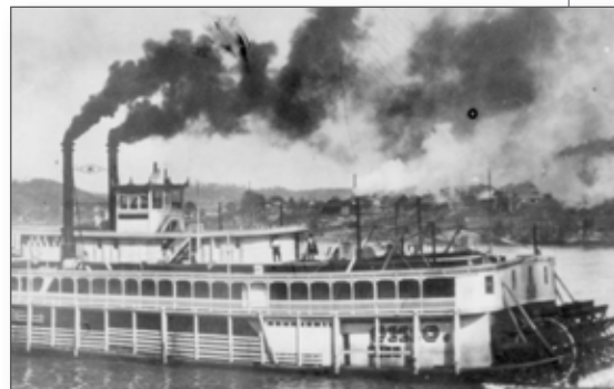
The arrival of steamboats in Louisville in 1811 changed life on the Ohio River forever.

In Europe, the Napoleonic Wars pitted Britain against France, with America officially neutral. But British harassment of American shipping renewed the old conflict with Britain. This tension also played out on the northern frontier of the new country, with British-backed native Americans locked in hostilities with settlers.