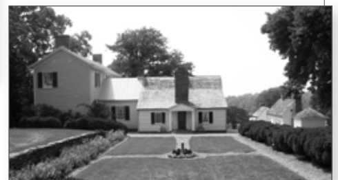
James and Dolley Madison's AshLawn-Highland