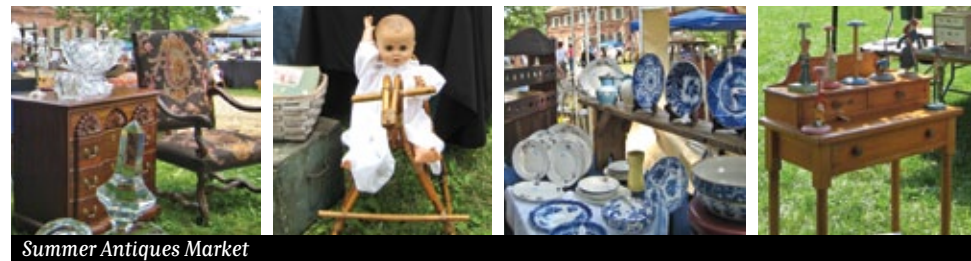
Summer Antiques Market

Locust Grove is most grateful to Publishers Printing of Shepherdsville, Ky., for donating the full cost of the printing of the new Grove Gazette . Let us know what you think — lghh@locustgrove.org .