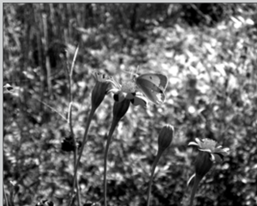
LANDSCAPE — First-place winning photo by Inanna Delaney.