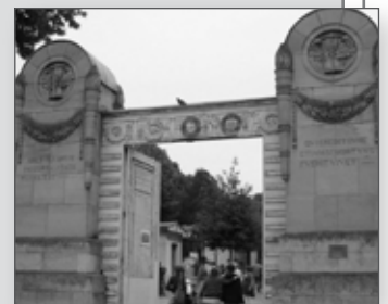
Père Lachaise Cemetery in Paris.

Père Lachaise is one of the most visited cemeteries in the world. Others of note buried there include writers Oscar Wilde, Gertrude Stein, and Honore de Balzac; actors Yves Montand, Sarah Bernhardt,