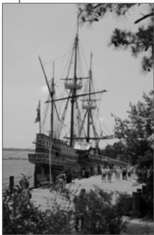
One of the three ships you'll see in Jamestown.