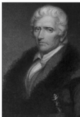
Engraving of Daniel Boone by James Longacre (1835) from an 1820 painting by Chester Harding.