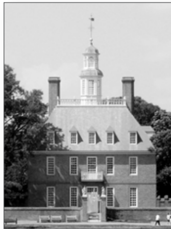
The Governor's Palace in Williamsburg.