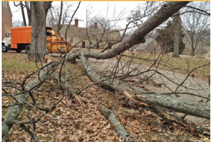
Visitors may notice slightly less tree cover shading the oval drive south of the house this spring. One of our oldest, largest oak trees lost a major limb in a windstorm in March. Metro Parks arborists believe that they can save the tree for now, but we are all keeping close watch on the aging trees around our historic structures.