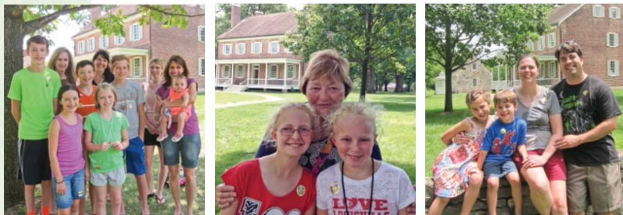
These are just a few of the many hundreds of people who have visited Locust Grove this summer as part of Metro Louisville's "Cultural Pass" museum promotion.

Instead of sending out a tour each hour with a few visitors, we've sent out multiple tours during the same hour or relied upon "station" tours. We've pressed all of our