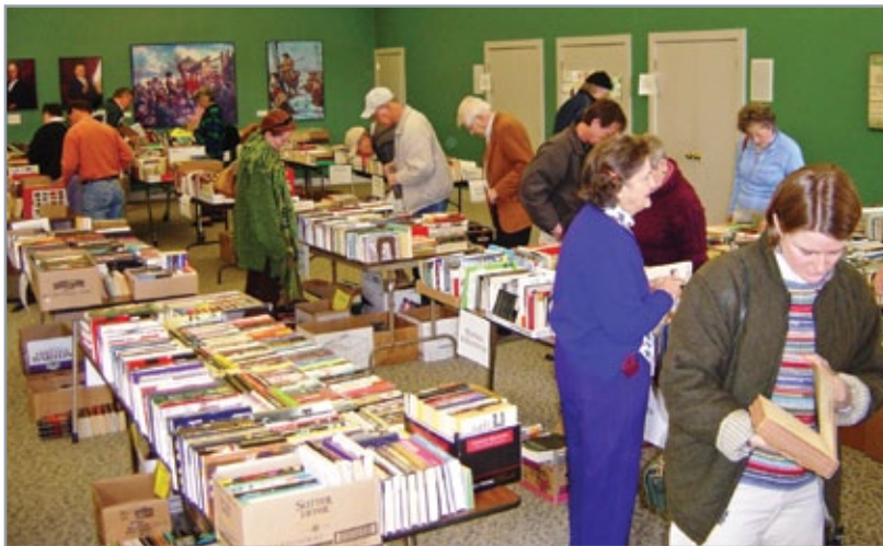
First book sale, March 2005

The financial benefit of our sales is tremendous for our education and outreach programs, including bus subsidies to allow all