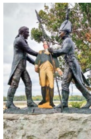
"George" visits the statue of his brother William greeting Meriwether Lewis at the Falls of the Ohio State Park in Indiana.

"Hey look, it's George Washington!" Actually, it's another George — George Rogers Clark. And he's really getting around these days.