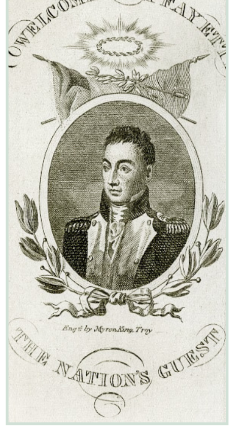
A commemorative banner from Lafayette's "victory lap" tour of the U.S. in 1824-25.

In the spirit of Lafayette — "Vive La France, vive Les États Unis, et vive la Révolution!"