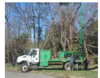
Geotechnical testing is underway.

We're gratified that a recent mailing to members is bringing in welcome donations to Locust Grove's capital campaign—"Campaign for a Third Century." We're working now with the landscape architects— Environs —to do the preliminary engineering and geotechnical studies of the site that are required for the permit process.